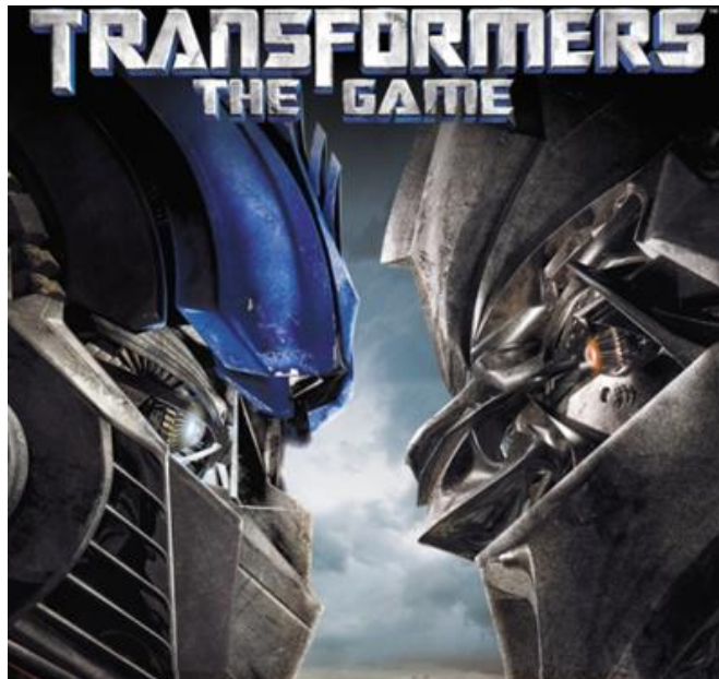
Transformers: The Game (2009/Repack/Portable) | 2 Gb

After years and years of waiting, Transformers fans finally have a big-budget, US-released action game starring the robots in disguise to call their very own. Titled simply Transformers, this new third-person shooter from Atari is based on the recent Transformers toys and cartoon series, which have subtitles like Armada and Energon, rather than the original toy line and television show from the early '80s that most 20-something gamers will be most familiar with. However, you'll still find plenty of (slightly modified) familiar faces in the game, like Optimus Prime, Starscream, and Megatron. More importantly, once you dig into Transformers' gameplay, you'll find a surprisingly intense combat model that's pretty tough but also rewarding once you get a handle on it.